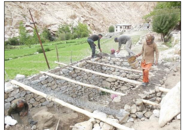
Building predator-proof corrals in India