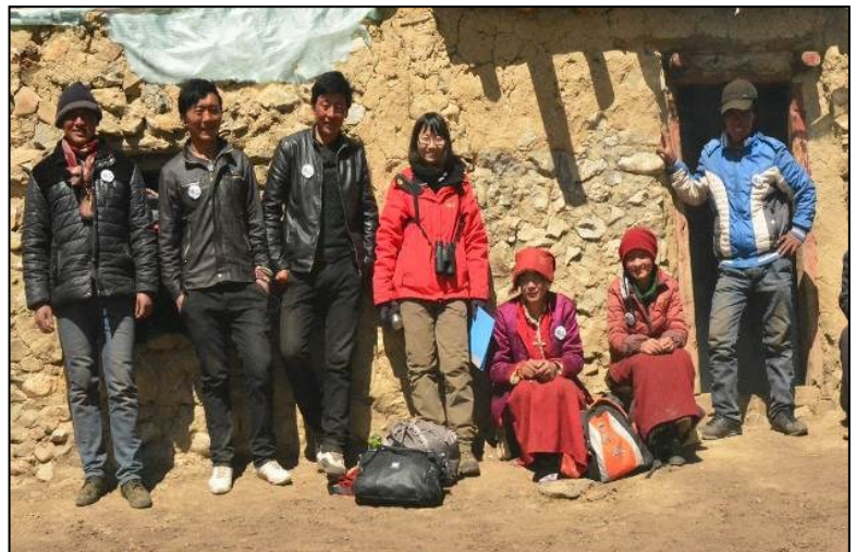
Working with villagers in China to set out trap cameras.

Between 2013 and 2014, 14 people from Yunta village (Qinghai Province) helped with trap camera surveys in Sanjiangyuan National Nature Reserve, some of the most important snow leopard habitat in China. Information on the abundance and distribution of snow leopards will help us better protect this prime habitat. Yunta villagers checked cameras every two weeks to make sure they were working properly. The cameras collected 47 snow leopard photographs of 6-9 cats.