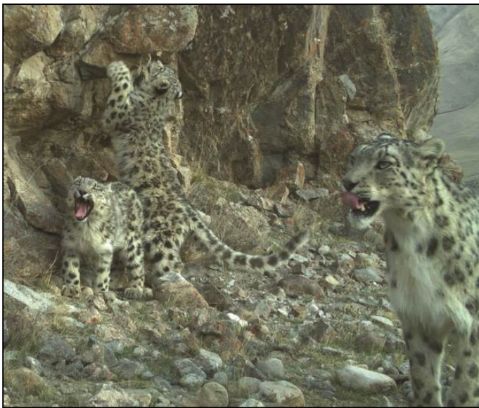
Mother and two cubs photographed in Kyrgyzstan, May, 2014.

To combat illegal hunting in Kyrgyzstan, in June 2014 we initiated a new 'Citizen Ranger Wildlife Protection Program' that publicly recognizes and financially rewards combined ranger-community teams that work together to successfully apprehend poachers within protected areas.